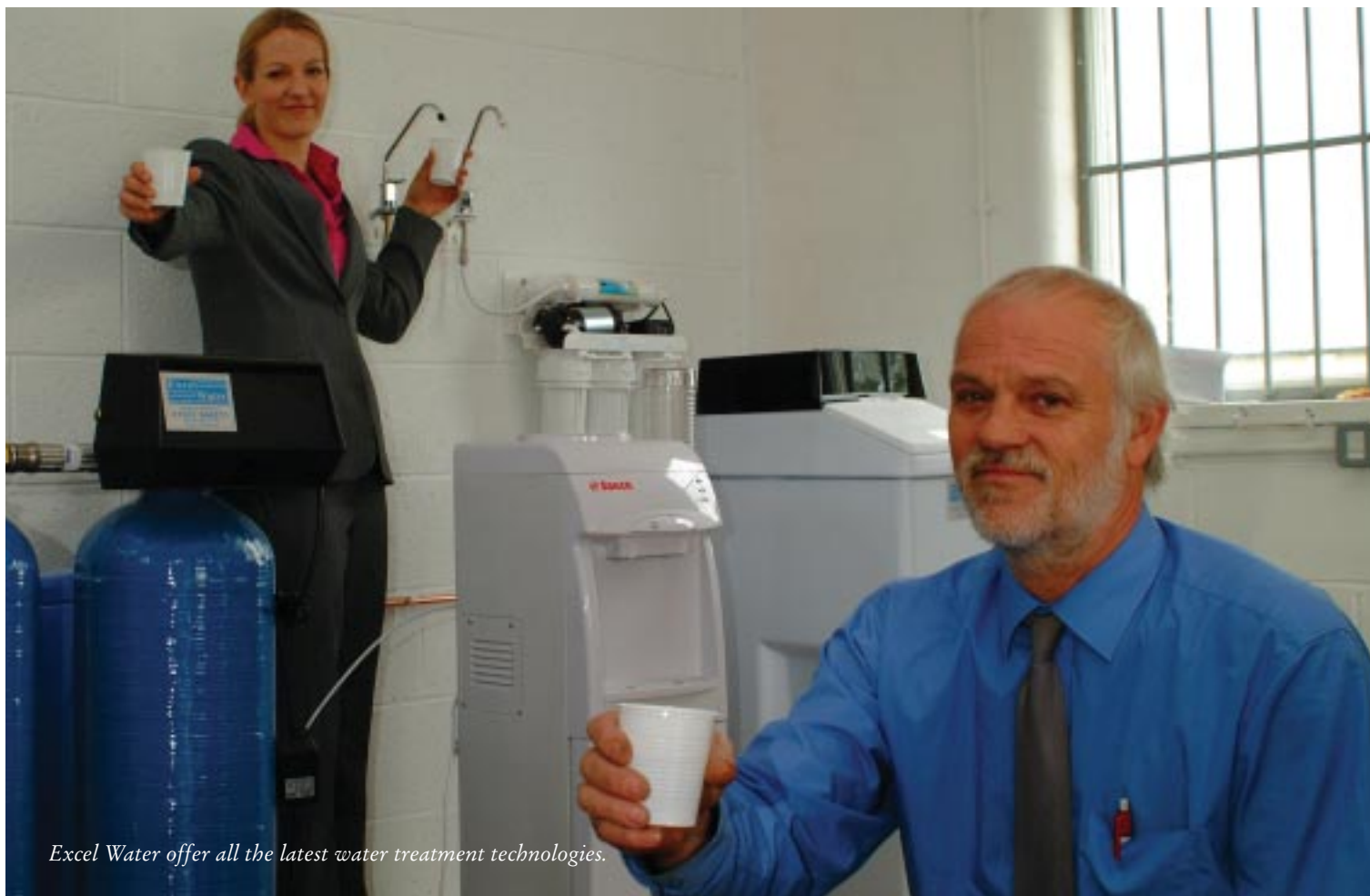
Excel Water offer all the latest water treatment technologies.

If you would like to discuss your water treatment requirements - for business premises or the home - in more detail call Excel Water on 01937 844 211 or visit www.excelwater.co.uk