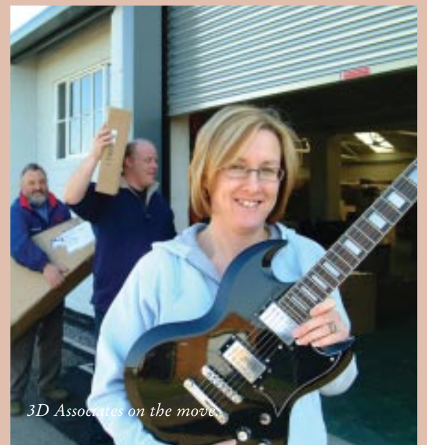
3D Associates on the move

refurbishment so it was done to our specification to meet our business needs. The new unit provides us with a greatly enhanced working environment, at very competitive rates, whilst allowing us to retain our position in a convenient location".